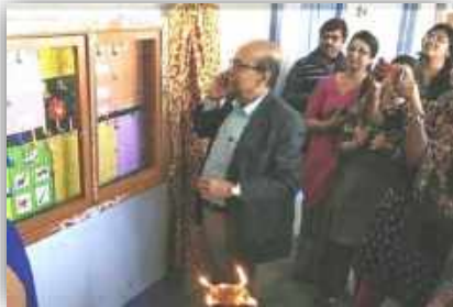
WALL MAGAZINE OF DEPARTMENT OF MUSIC

In addition to the annual college Magazine, the wall magazines of various departments also provide an opportunity for the students with a flair for creative writing.