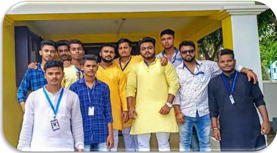
GLIMPSES OF NABIN NARAN PROGRAMME ORGANISED BY STUDENT'S COUNCIL