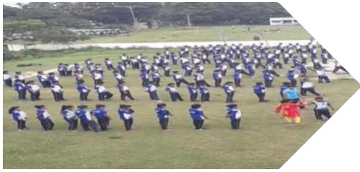
Champion in District sports and games in women's section (January 2020).