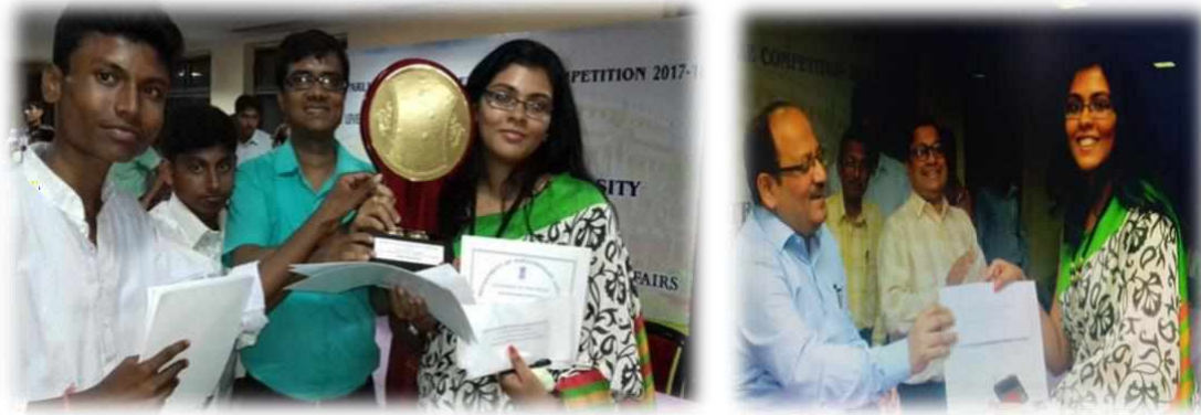
We won District Level Championship in 2017

Our students have been attending youth parliament session regularly and achieving successful results too. They are getting to understand the Constitutional rules and obligations as well as Citizens' Rights in the process.