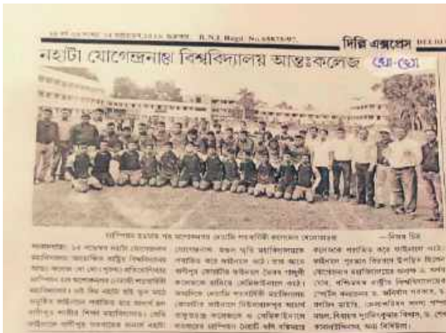
Inter College (men) Kho-Kho Championship