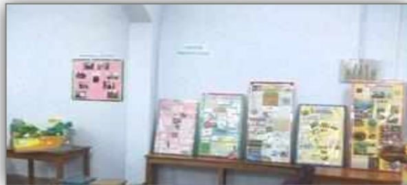
3D WALL MAGAZINE OF DEPARTMENT OF GEOGRAPHY