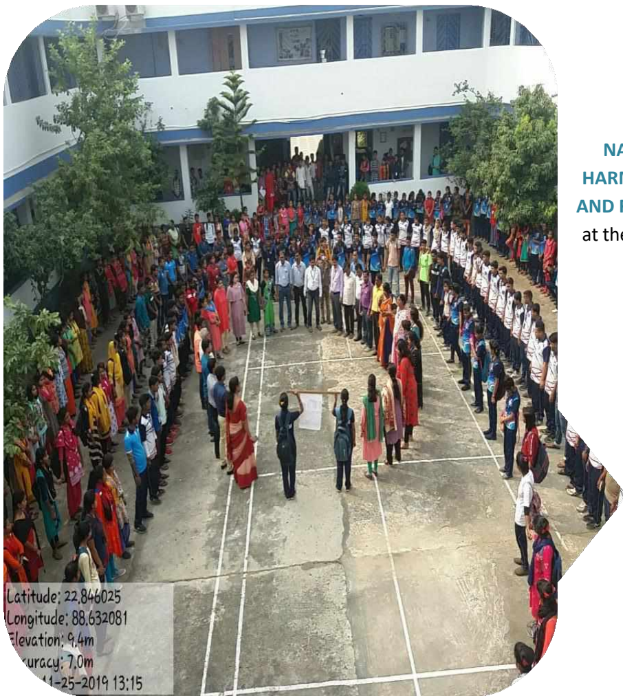
NATIONAL COMMUNAL HARMONY CAMPAIGN WEEK AND FLAG DAY was celebrated at the college on 25/11/2020.